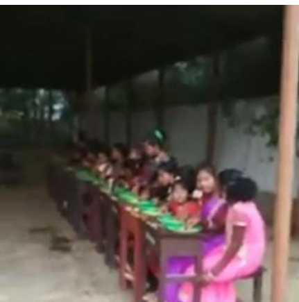
Every year Rabindranath Thakur Mahavidyalaya and lovely kids and villagers of our adopted village jointly celebrates Republic Day, Independence Day, Saraswati puja etc.