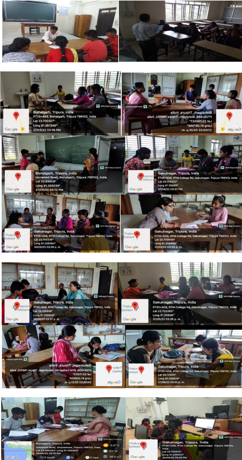
Classes of 'Uttarayan'