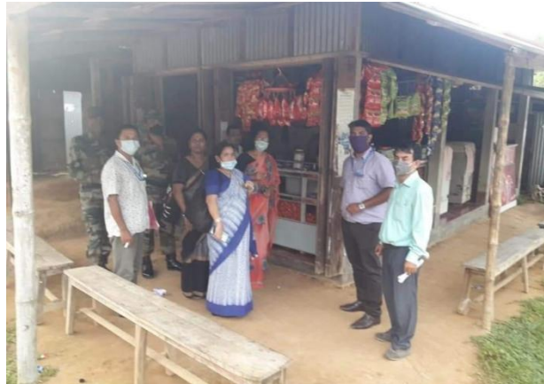
Anti-tobacco Campaign was done in RTM, Bishalgarh and also in Adopted village under Harishnagar Gram Panchayet.