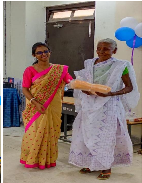
International Women's Day was celebrated on 8 th March, 2021 & some villagers were felicitated in that Programme.