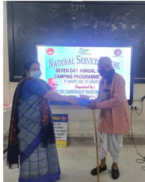
Five old individual from adopted village was felicitated with basic amenities like mosquito net, nutrition food etc. by the college NSS Unit.