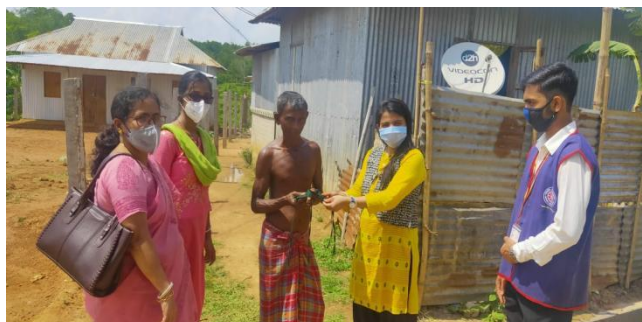
Awareness program on Omicron variant of covid-19 was held at adopted village, Harishnagar and mask and leaflets were distributed by the NSS Unit of the College.