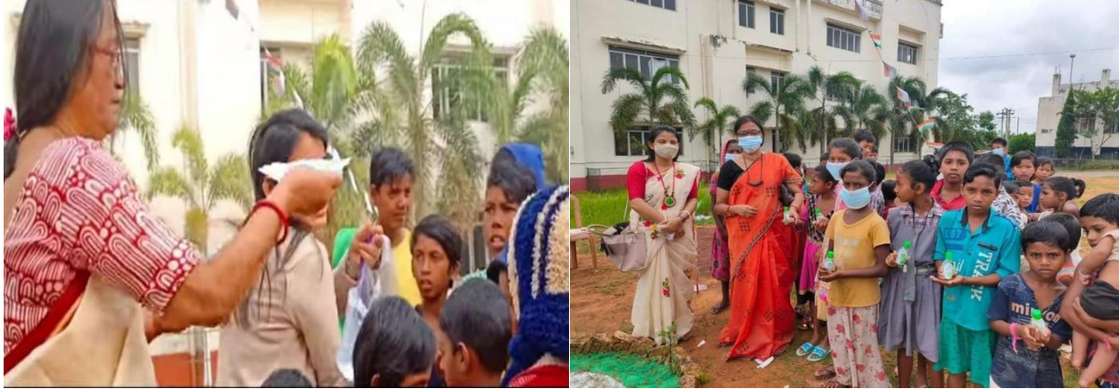
Masks and sanitizers were distributed among the kids of Adopted village from the UBA, RTM Unit on the occasion of Independence Day.